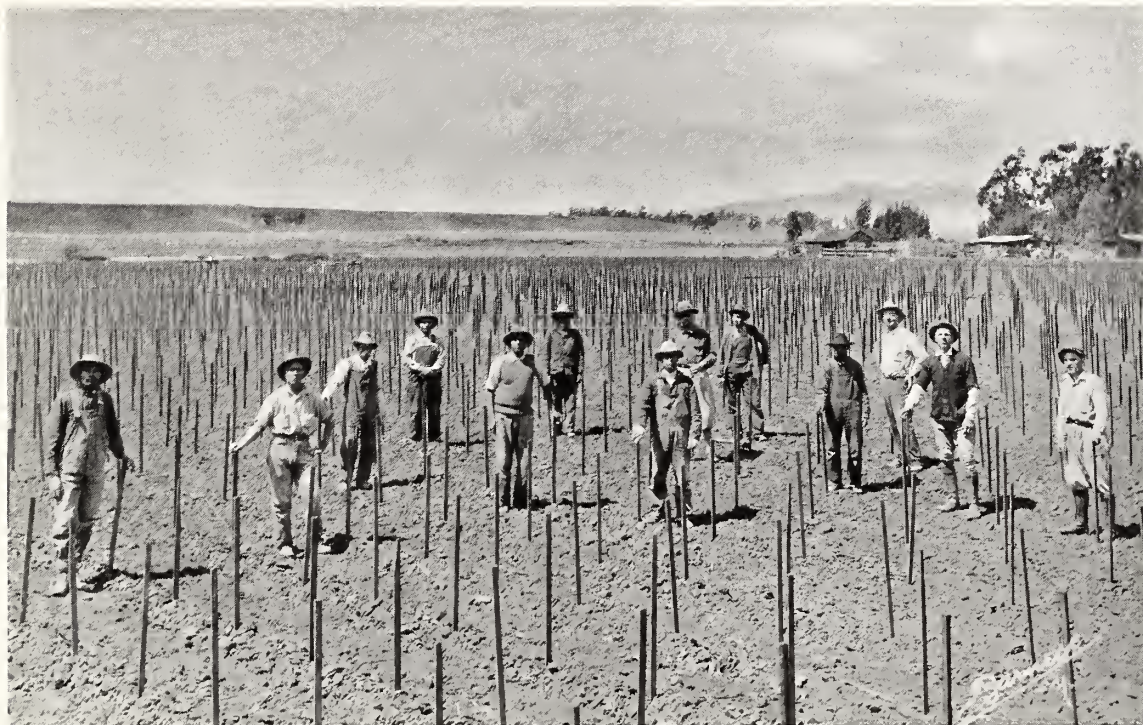
A portion of our 1928 gardens. Our men preparing to plant Dahlia tubers. Note we drive our stakes before planting.